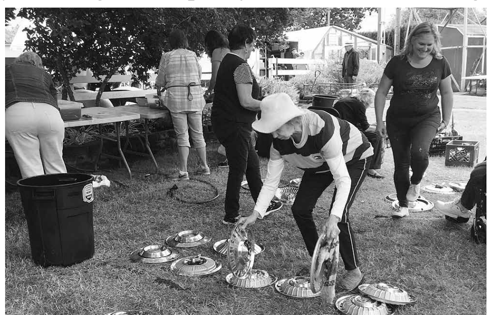
We noticed at last spring's Swap Meet that the clean, shiny stuff was selling, and the grungy things weren't. Next spring, our hubcap collection will be clean and sorted into sets, thanks to the CPPC women who rolled up their sleeves and went to work while the men were curating the inventory in the trailer.

salad and a potluck selection of desserts.