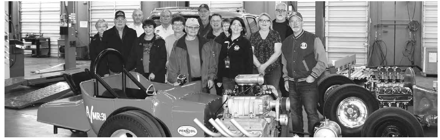
An indoor activity is a great way to start the car-club season in the Pacific Northwest. World of Speed's featured display was 1960s Formula 1 Race Cars. See the whole story and more of Mike Bade's pictures on CascadePacificPlymouth.org