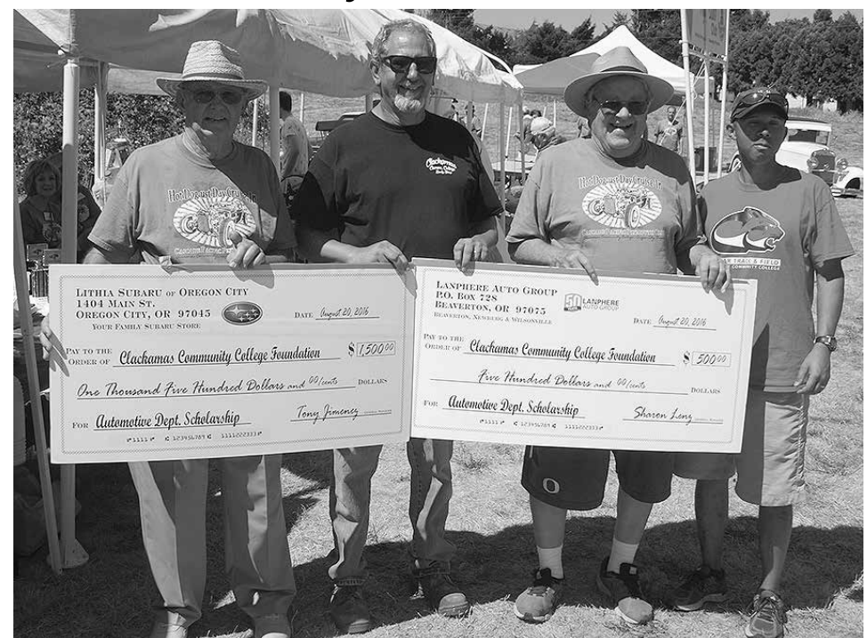
There were some great big checks handed over by the time this year's Hot Dog-Ust Day ended, and these particular big checks were only part of the total. $3000 went to the Automotive Technology department for scholarships, and $500 went to the track/crosscountry teams who cooked hot dogs, parked cars, and handed out cold water all day.