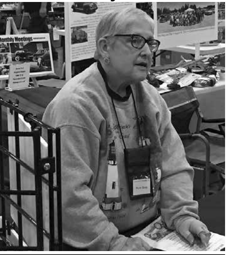
Guest speaker reproduces old-time window decals

The Tech Committee thanks everybody who showed up to to work, or to help with load-in and load-out, at this year's event.