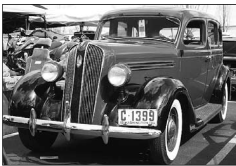
This 1936 Plymouth 4-door sedan appeared to be an amateur restoration in good mechanical shape. It sold before the end of the meet.