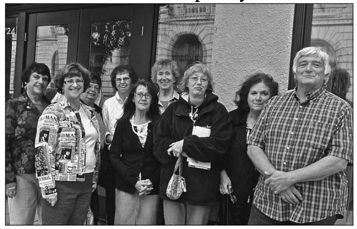
In keeping with their mission of going interesting places, the Mayflowers voyaged to the Museum of Contemporary Crafts in the Pearl District in downtown Portland, on October 10. Lunch was nearby, at Henry's Tavern and Pub on NW 12th Avenue. Judging by the pictures they shared, everybody had a good time.