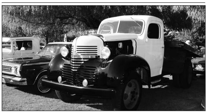
LINEUP AT BEACHES: Roger Edwards' 1940 Dodge factory tilt bed 1.5-ton truck is in foreground, with Lorraine Griffey's 1966 Belvedere and Bades' 30U hotrod barely visible in back.

The Mayflowers' entire purpose is to get out and visit interesting people and places in the Pacific Northwest. Everyone is free to join in.