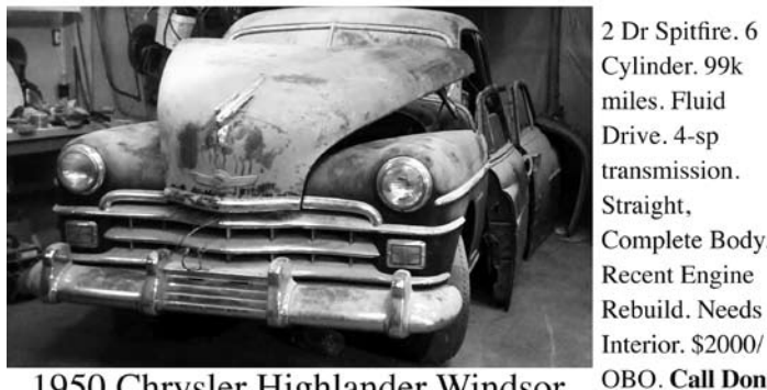
1950 Chrysler Highlander Windsor FOR SALE