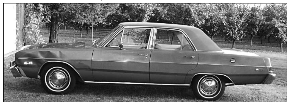
The '74 Dodge Dart, above, still runs and drives.

So I am offering a 1949 Plymouth restoration project to the readers of this newsletter. I will sell it all to the highest bidder. I have no minimum in