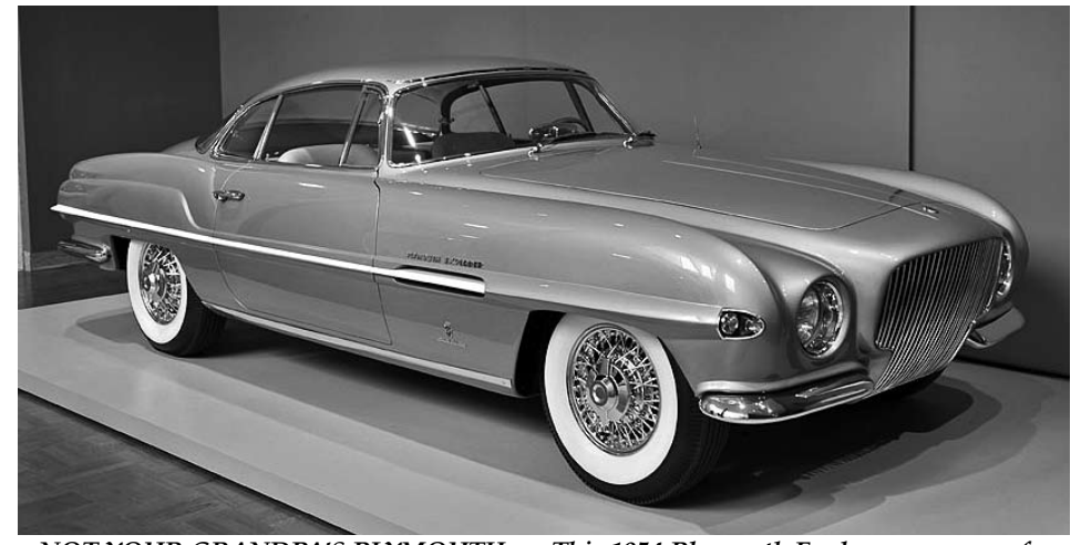
NOT YOUR GRANDPA'S PLYMOUTH . . . This 1954 Plymouth Explorer was one of a handful of Ghia-built dream machines commissioned by Chrysler Corporation after they finally realized that styling could sell cars. There's only one of these, and it's on display at Portland Art Museum right now. Picture is from conceptcarz.com, which also has the best online discussion of the to-die-for early '50s Chrysler-Ghia collaborations.

The Explorer was created on a 114" wheelbase, the same as production '54 Plymouths. It looked fast, but it was powered by the 110hp 230ci 6-cylinder engine, and a Hy-Drive transmission.