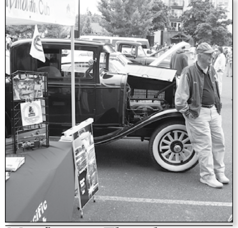
Mayflowers, Thursday Sept. 15th with the Dimicks

The Cruise-In is limited to 100 vehicles. Check-in starts at 8:00AM, and the registration fee is $15. Pre-registration instructions are available at www.sandyoktoberfest.net under the Car Show Information tab.