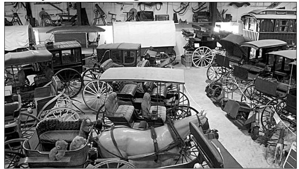
IT'S THE CURTIS FAMILY'S collection of horse-drawn trailers, in Southeast Portland, which is soon to be dispersed and absorbed into other collections nationwide. CPPC members will be able to tour the collection Wednesday evening, March 2, and dinner is being organized at a nearby restaurant. Learn more about it at our February 22 meeting.