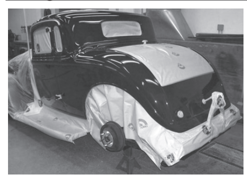
The third time had better be the last time for Rich VonAllmen's 1933 PC 2 Door Rumble Seat

Cascade Pacific Plymouth Club, Inc. April 2008 Page 6