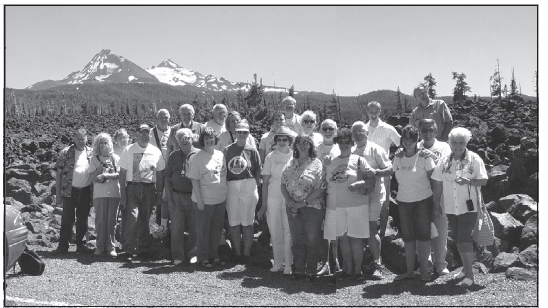
CPPC Members pose for a group shot at the Dee Wright Observatory, what a beautiful back drop on this sunny day.

We still had more of the "scenic" (i.e. scary) highway into Sisters. The Marble car had a little vapor lock problem leaving the day use site but headed downhill for an easy start and rejoined the group at the Dee Wright Observatory.