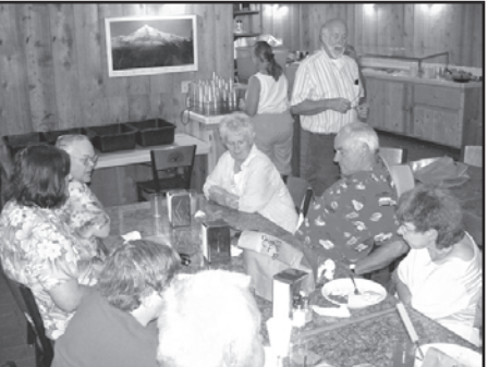
Everyone had their fill at the Buffet Lunch.