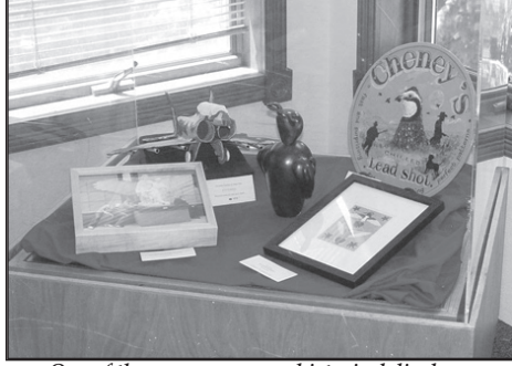
One of the museums many historical displays