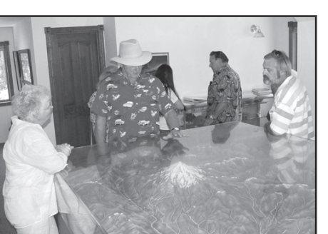
Three Dimensional Map of Mt. Hood area.

After touring the museum the large group dispersed and headed home along their various chosen routes.