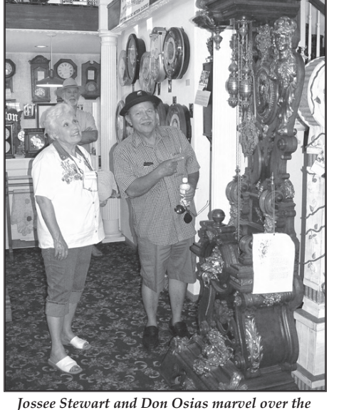
many elaborate clocks on display