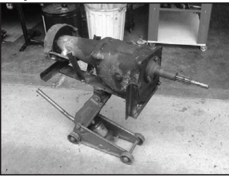
Jimmie Fox's home made Transmission Jack If you are interested in more details call Jimmie.