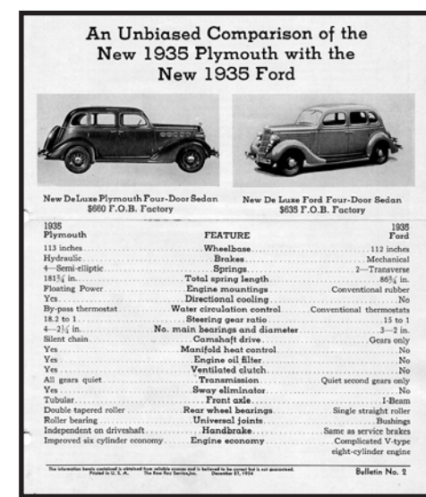
1935 Plymouth Ad

New address for Knut Austad 2118 NE 121st Ave. Portland, OR 97220 Add cell # 503-260-0044 55 Plymouth Knut drove a 55 Plymouth taxi cab in Norway before moving to the USA