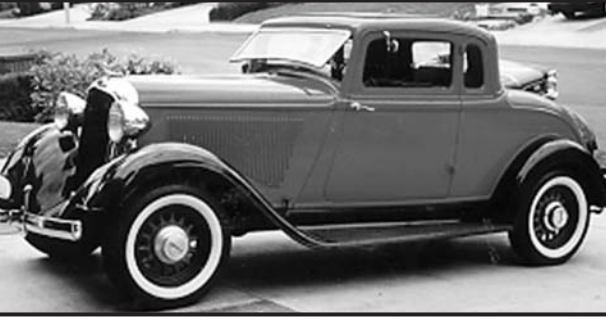
The Hunley's 1933 Plymouth PD Coupe

The '33 was the "Runtof-the-Litter" in a collection of 30's Chrysler Products in the gentleman's collection. The '33 had been restored in the late 60's and had a winning pedigree, a "Show Winner" in several 1970's Antique Auto Club of America shows, in the New England