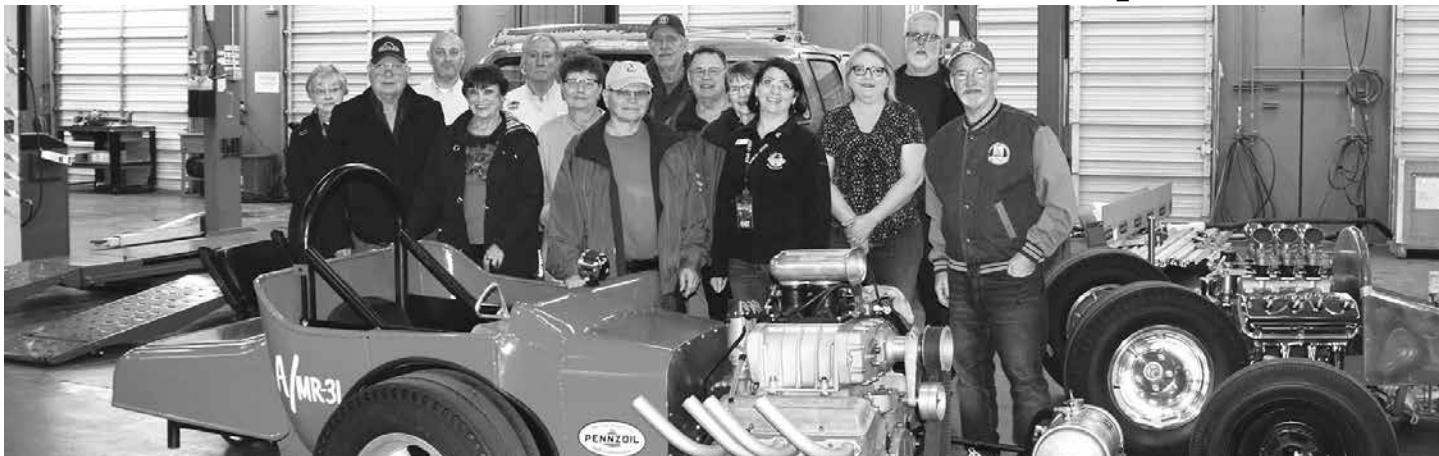
An indoor activity is a great way to start the car-club season in the Pacific Northwest. World of Speed's featured display was 1960s Formula 1 Race Cars. See the whole story and more of Mike Bade's pictures on CascadePacificPlymouth.org