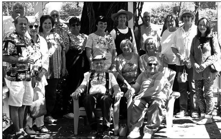
ABOVE: Check out this sun-dappled group posing at the Hulda Klager Lilac Gardens in Woodland, WA. BELOW: Various other nymphs and sprites were also in attendance.