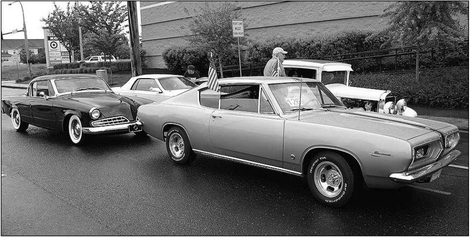
ABOVE: One Studebaker, one Chrysler, two Plymouths represented CPPC at the Hazel Dell Armed Forces Day Parade of Bands.

event with a lot of nice people. We will check on this event for next year and hope that the weather cooperates and we can field more CPPC cars.