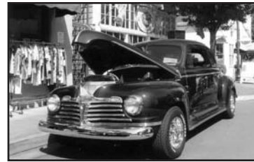
1942 Plymouth Coupe