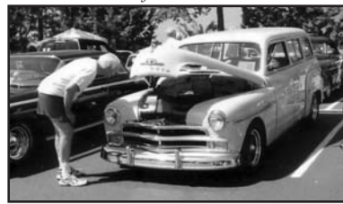
1950 Plymouth Suburban