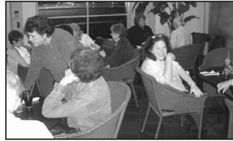
Lunch at the Cadillac Cafe