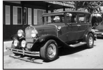
1929 Plymouth 4 Dr. Sedan

The first is a 1929 Plymouth 4 Dr., painted in a striking Royal Blue color. The next is a 1942 Plymouth Coupe, painted in a beautiful Maroon. The final car is a 1950 Plymouth Suburban, painted in a Beige color. Herb Watkins checks out the power under the hood of the Suburban.