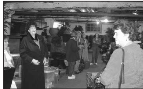
CPPC Members Tour Pottery Warehouse