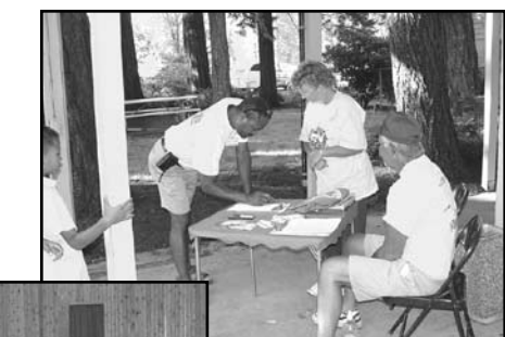
Tour Participants Check-in at Potluck.