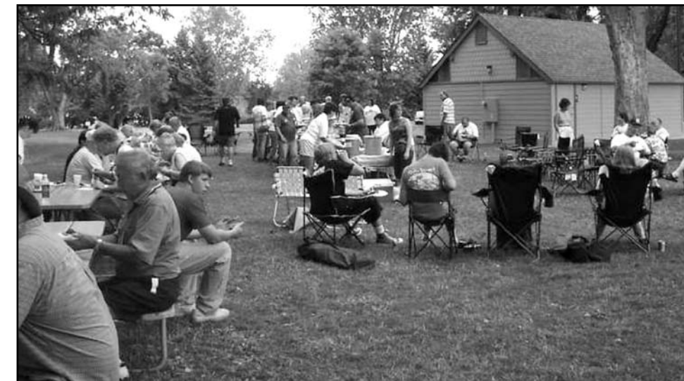
Hot Wheels Car Club hosted a picnic at Pioneer Park, Walla Walla, WA

He suggested his car club show the tour participants some Walla Walla hospitality! The timing was perfect since tour participants coming from Missoula had spent one of their more difficult driving