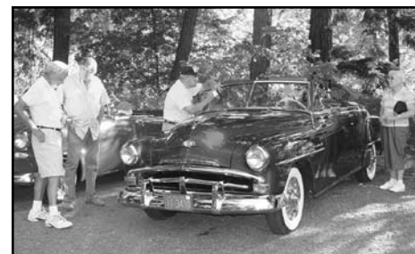
CPPC Members take time to see cars at potluck

Once in Troutdale CPPC had a fantastic bar-b-que dinner. A count showed 152 people attended this event! 8 more Plymouths and 20 more people joined the tour in Troutdale. Les and