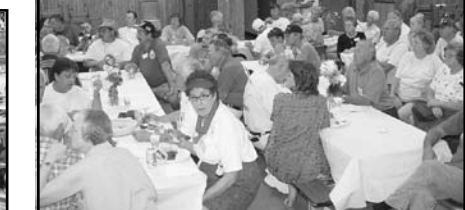
Everyone seemed to have a good time.