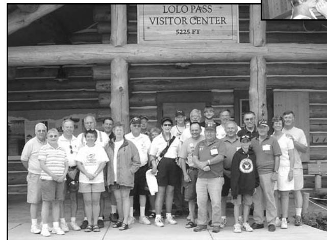
2003 Coast to Coast Tour participants at Lolo Pass enroute to Newport, OR and final leg of the Plymouth 75th Anniversary Tour